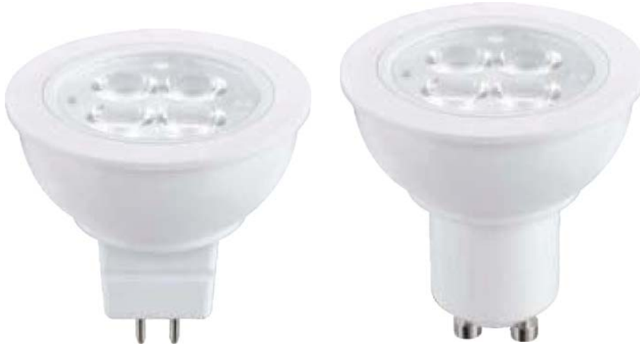
GX5.3 base (Class III)

PC coated aluminium housing LED lamps, ideal replacement for traditional spotlight