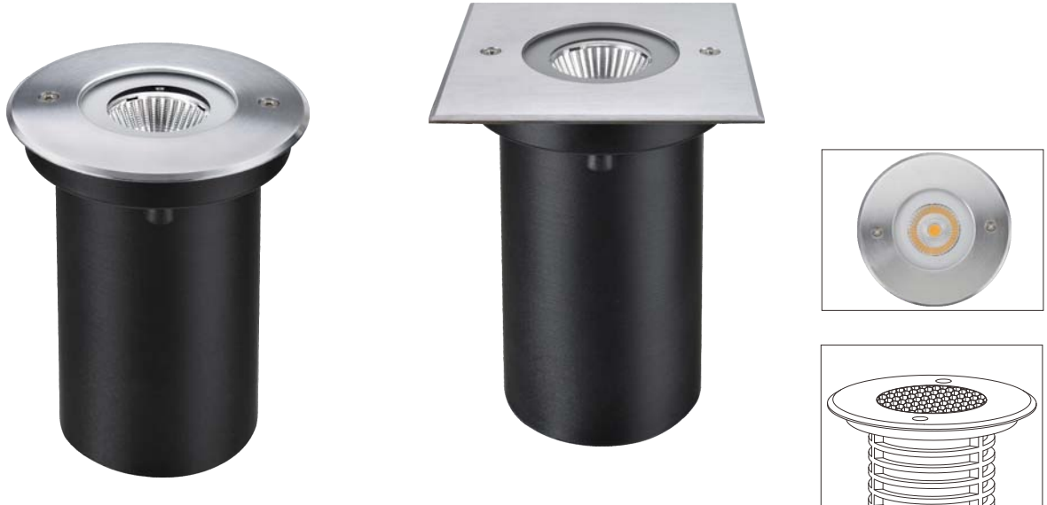
Honeycomb_louwer version (NELED4205(R)L)