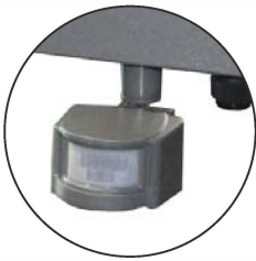
Optional PIR sensor