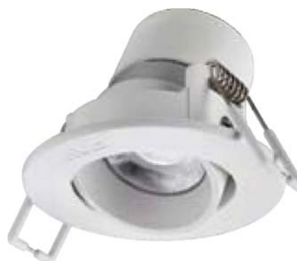
NLED119*D (Polycarbonate bezel)