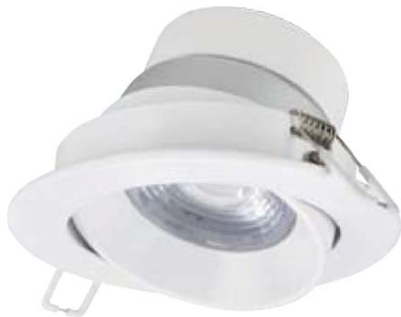
NLED119*DL (Aluminium bezel)