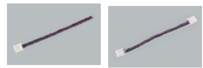
Power connector for RGB color