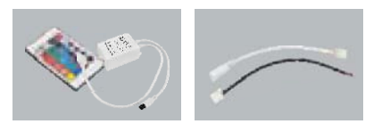
RGB infrared controller and remote